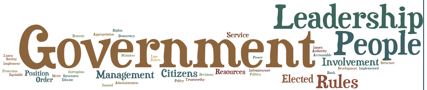
Figure 2: Word Cloud based on frequency of the words used to describe governance